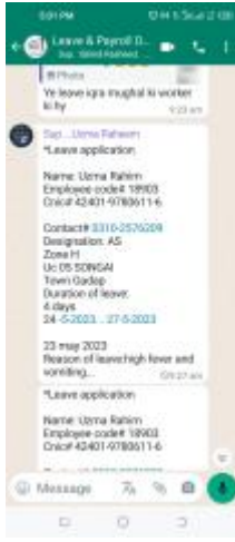
IMG-20230605-WA0044.jpg ~77 KB