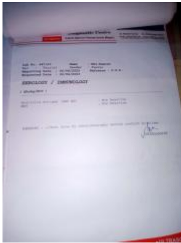
IMG-20230724-WA0141.jpg ~55 KB