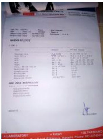
IMG-20230724-WA0143.jpg ~115 KB