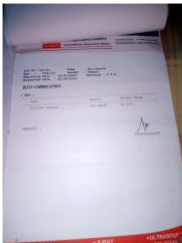
IMG-20230724-WA0140.jpg ~58 KB