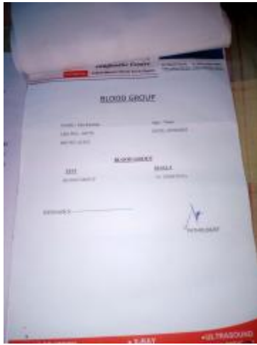
IMG-20230724-WA0147.jpg ~60 KB