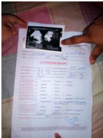
IMG-20230724-WA0148.jpg ~143 KB