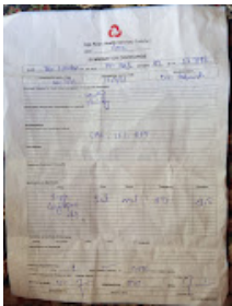
DC hamdan 196K