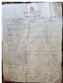
DC hamdan 196K