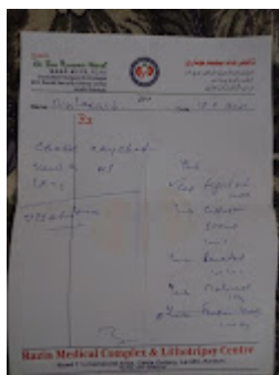
UCPO Laraib Medical prescription.jpg