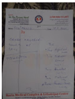
UCPO Laraib Medical prescription.jpg 79K