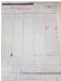
Tallysheet Front.jpeg 237K